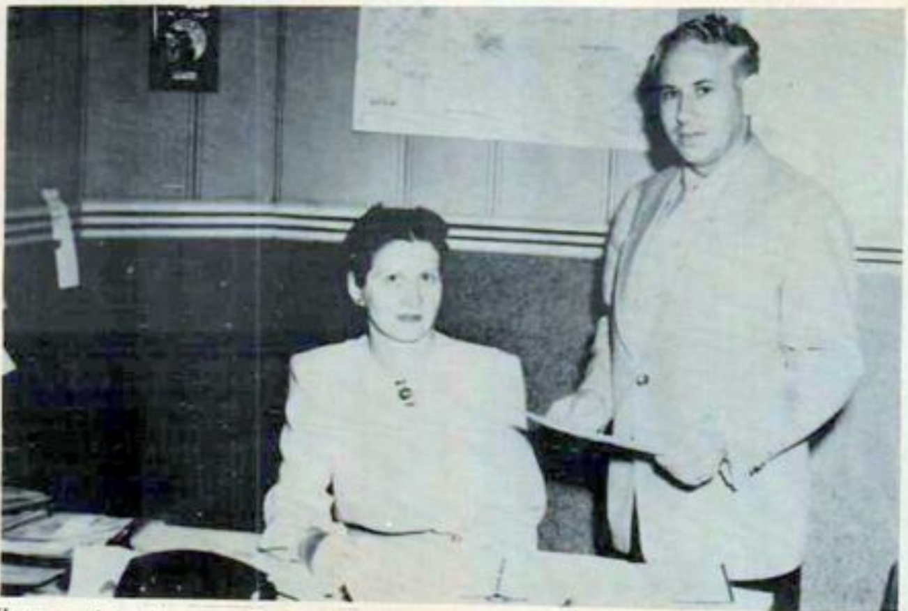
Here is one of the best known husband and wife teams

Rochester residents. Their new business venture gives them a new site from which to greet many old friends.