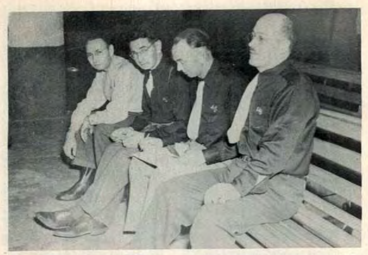
Here are four bowlers in Wednesday night's league taking it easy while they watch proceedings. Left to right