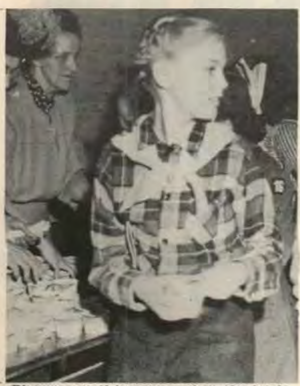
Pictures on this page and at the back of the magazine show Girl Scouts at the birthday celebration of Juliet Lowe, found of the Girl Scouts. The Brownies, Intermediate Groups and Senior Scouts presented a program.