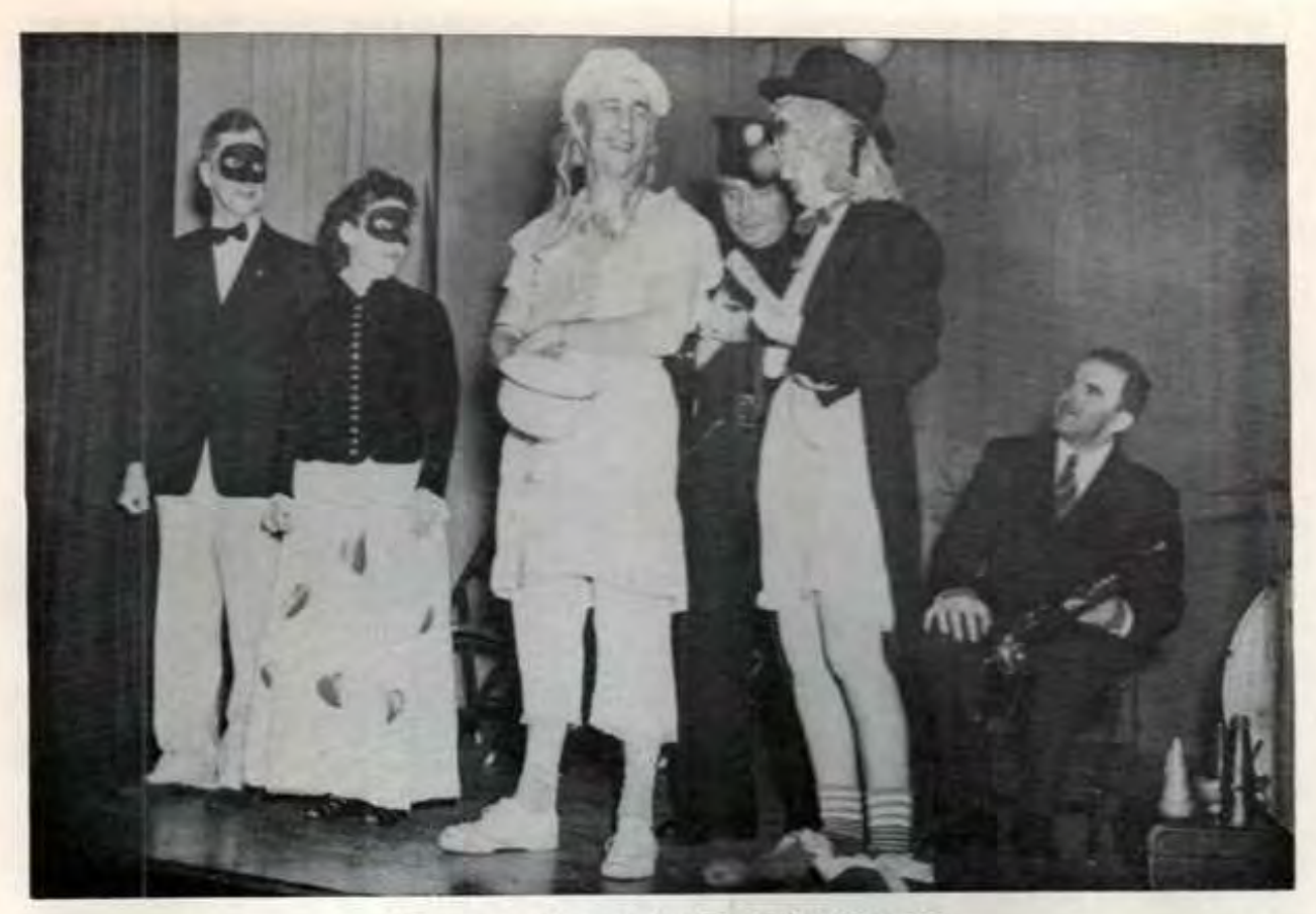
Here are the costume prize winners, on stage at the end of the judging.