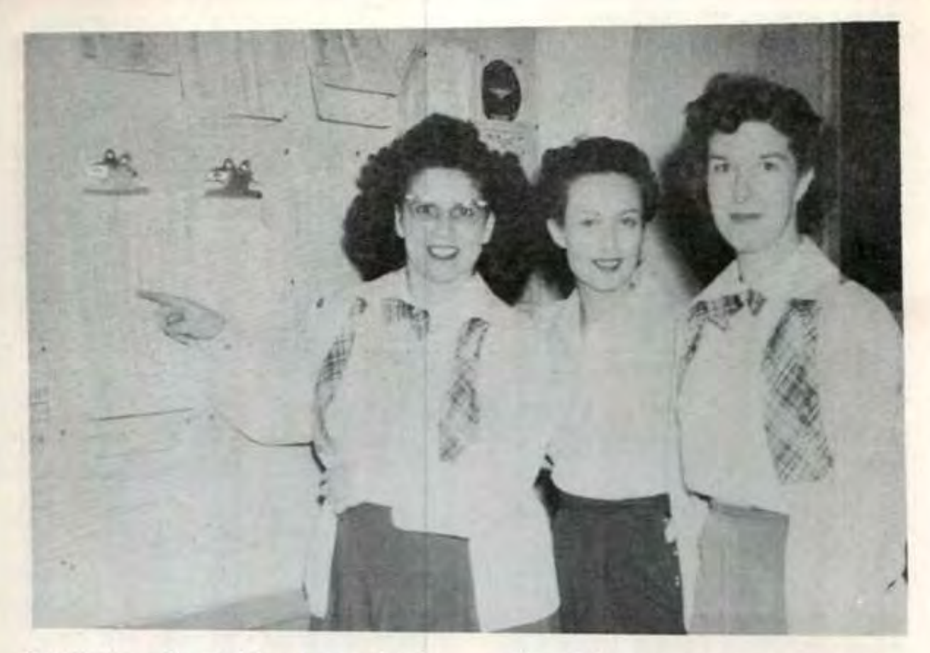
Don't think the weekly average sheet isn't watched carefully by the girls. In this picture, LENS interrupted this