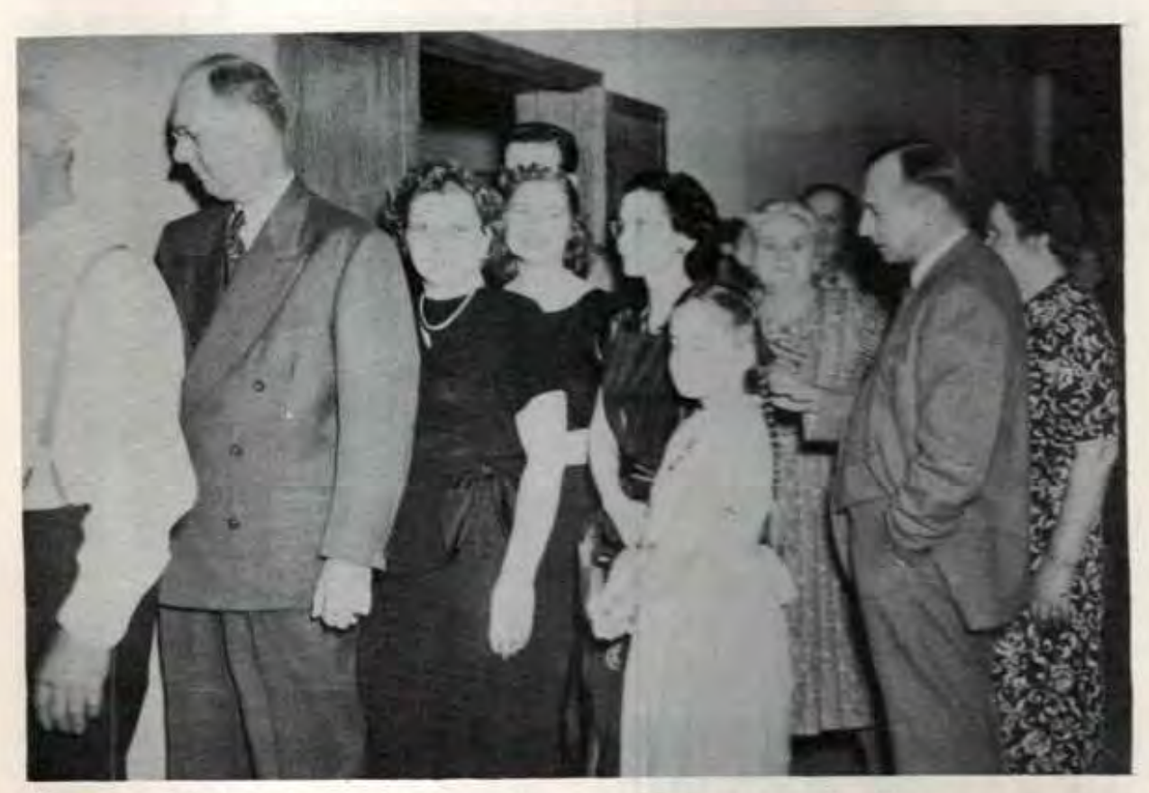
During intermission, the crowds flocked to the cafeteria for food prepared and served by the Blue Star