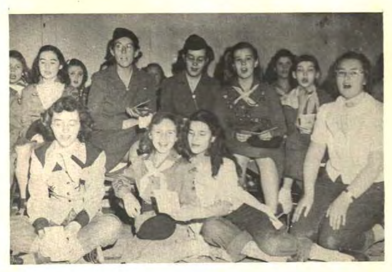
GIRL SCOUTS IN CELEBRATION